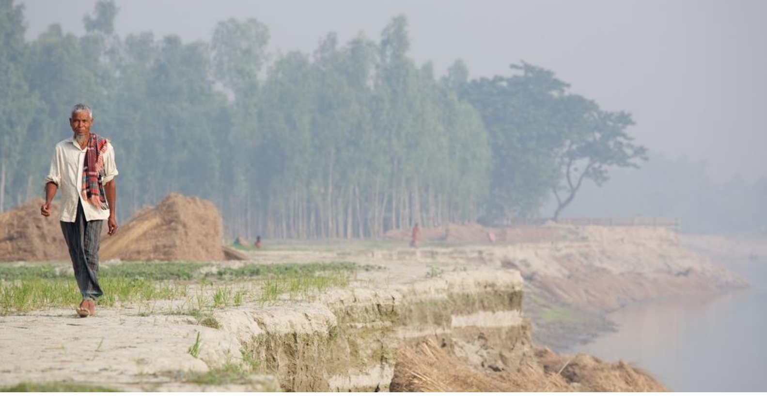
A man walks along an ever-eroding char (sand island) close to the town of Fulchuri Haat. The area is prone to seasonal flooding.

Low-lying and densely populated Bangladesh is one of the most exposed countries on earth to the impacts of climate change. <sup>48</sup> In the coastal regions, rising seas, compounded by severe tropical cyclones and storm surges, are already displacing communities from their land and homes. <sup>49</sup> In mainland regions, riverbank erosion from intense monsoonal downpours is increasing the already extreme risk of flooding, leading to thousands of people becoming landless and homeless each year. <sup>50</sup>